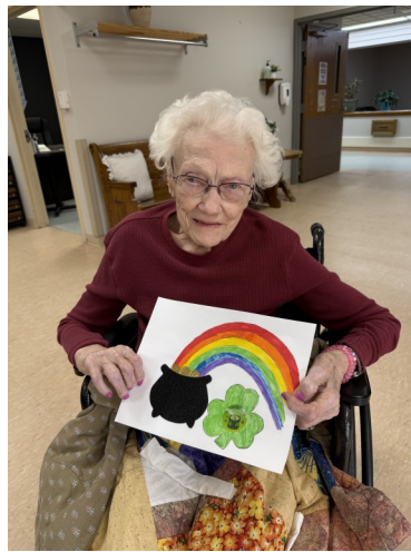
Our St. Patrick's Day celebrations included the creation of these very colorful rainbow pictures which featured a shamrock, a rainbow, and of course, a big pot of gold at the end of the rainbow!