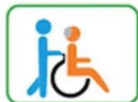
Walking or moving around

If you would like more information about occupational therapy services provided by Dove Healthcare - Spooner, please contact me.