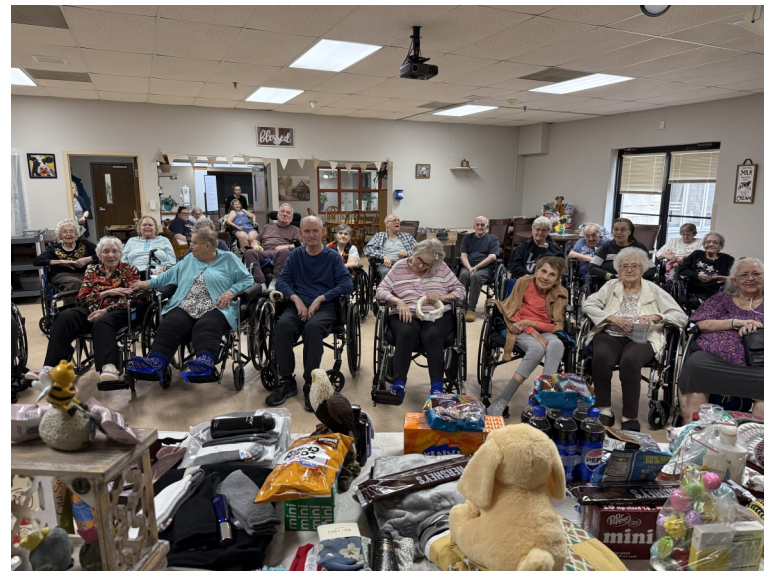
Our residents eagerly participated in an activity in March that awarded Dove Dollars in preparation for our first Activity Auction. A large group of residents then gathered on Wednesday, March 26 to bid on a variety of items with many wonderful bargains to be had. A total of $84,860 Dove Dollars was spent!