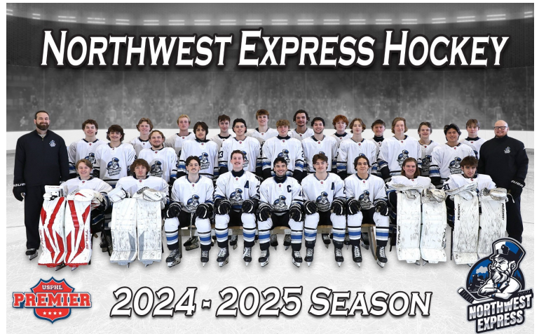
Thank you to the Northwest Express Hockey team for volunteering at bingo throughout the 2024-2025 season. We appreciated your help and love getting to know you. We look forward to seeing you again next season!