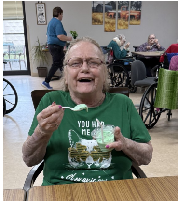
Our St. Patrick's Day fun featuring big money bingo followed by yummy shamrock shakes... what fun!