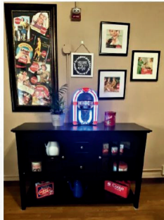
Resident Dining Room - Farmhouse